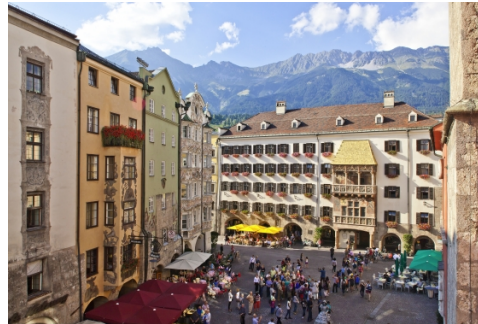
Innsbruck Old Town

Meeting point Innsbruck The conference hotel is a 1.5 h drive away from Innsbruck, the capital of Tyrol. Innsbruck is perfect for a visit before or after the conference. The so-called Capital of the Alps is nestled between two Alpine giants. It is famous for its climbing, skiing and biking hotspots. Visit the lovely old town with The Golden Roof , Amras Castle or go up to 2000 m above the sea level right away from the city centre by hiking or using the cable car. By train you can get to Salzburg in two hours and to Vienna in four hours.