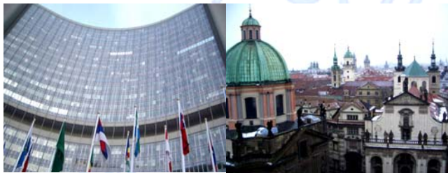
UNO-City Vienna — view over Prague

Applications should be submitted to the Faculty of Business, Economics and Law, The University of Queensland (Australian coordinator of the program) at the earliest date, accompanied by a non-refundable fee of 100 AUD$.