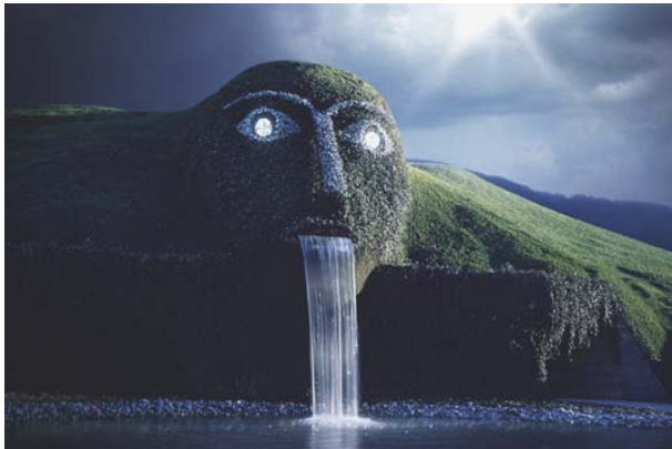
Swarovski Crystal World

„I would recommend the program, because it allows to understand Europe, its history and economy.“