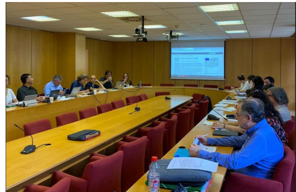
Dissemination event at the University of Valencia.

A dissemination event at the University of Valencia, attended by Spanish representatives of the evaluators' target group and experts, was the highlight of the transnational meeting. After a presentation of the project, an intensive exchange of views with the target group took place.