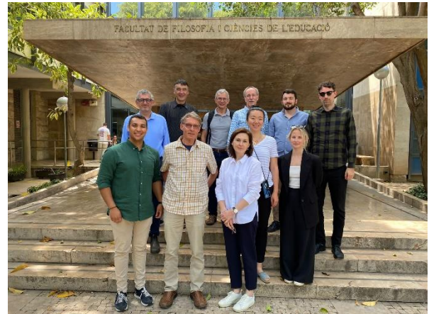
The RecoVET project team in Valencia.

This opportunity was used by all partners to present their concept for the chapter "Lessons learned" in the RecoVET manual. Furthermore, a workshop on the learning units of the online tool was part of the program. In tandem teams, general feedback on the online tool was developed to enable further improvement of the tool and its functions. In another workshop, the questions for the online survey to evaluate the acceptance of the online tool among the target group were evaluated and critically discussed.