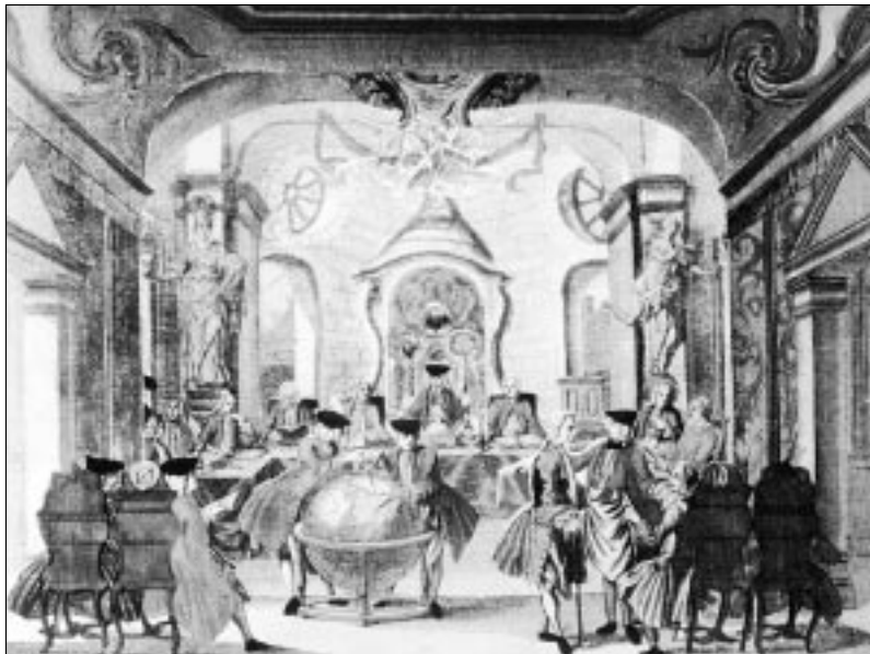
Fig. 4 Diorama of a Viennese masonic lodge of 1750 showing scientific work being carried out

Figure 4 shows a picture of the inside of an Austrian masonic lodge of 1750 and illustrates many interesting features relevant to our story. In the foreground we can see various of the brothers carrying out scientific work and utilising the familiar tools of freemasonry. Prominent is a large globe being subjected to various scientific measurements. Behind these workers are other lodge members carrying out some other sort of masonic activity. At the rear of the scene are two small columns, at the top of which are a sun symbol and a moon symbol. In the centre at the rear is an alchemical furnace burning away. Also of relevance are the two large columns surmounted by statues of, respectively, the gods Athena Pallas and Hermes.