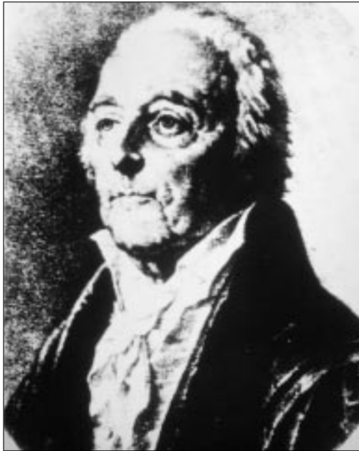
Fig. 7 Nikolaus Joseph von Jacquin (1727-1817)