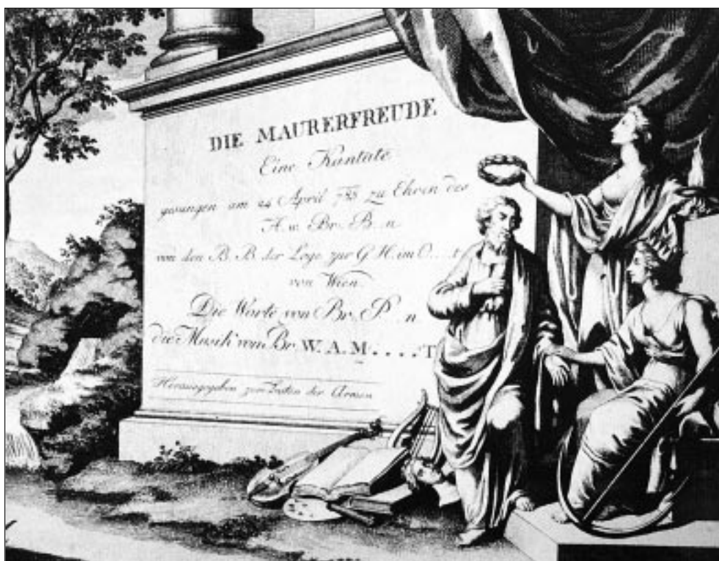
Fig. 10 Title page of Mozart's masonic cantata 'Die Maurerfreude' written and performed to celebrate the successful outcome of Born's laboratory and industrial-scale researchers into the use of amalgamation procedures in the production of noble metals from their ores.