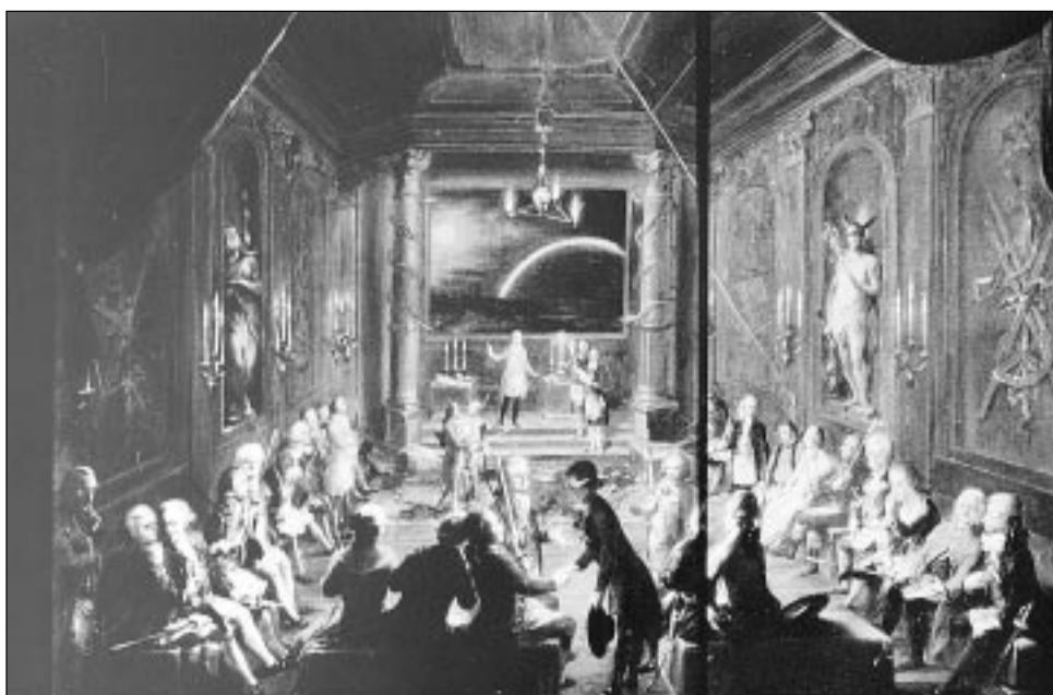
Fig. 5 Inside the masonic lodge 'Crowned Hope' c. 1790

The famous picture shown in Figure 5, now in the Historical Museum of the City of Vienna, was painted in about 1790 and shows the inside of what is thought to be the Crowned Hope Lodge in Vienna. There has been much discussion about recognition of the personalities in the painting especially the comments by ROBBINS LANDON (1982). Of particular interest are the possibility that MOZART himself is present at lower right, even perhaps sitting next to SCHIKANEDER. Also tentatively identified is the young actor, playwright and budding scientist GIESECKE (see below) fifth figure from the front left (seated). Little has been said about some of the symbolism seen in the rest of the picture.