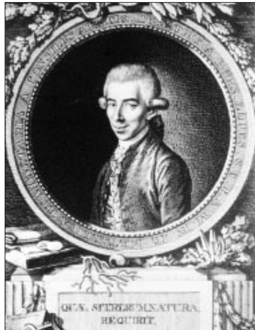
Fig. 9 Ignaz von Born (1742-1791)

Early in his career BORN was involved in a serious mining-related accident which affected him greatly for the rest of his life. Ostensibly on health grounds, he resigned his official post in 1772 and retreated to his country home where he produced his 'Index fossilium' in two volumes (published in 1772 and 1775), the catalogue of his own mineral collections and a fine example of the high quality of his work.