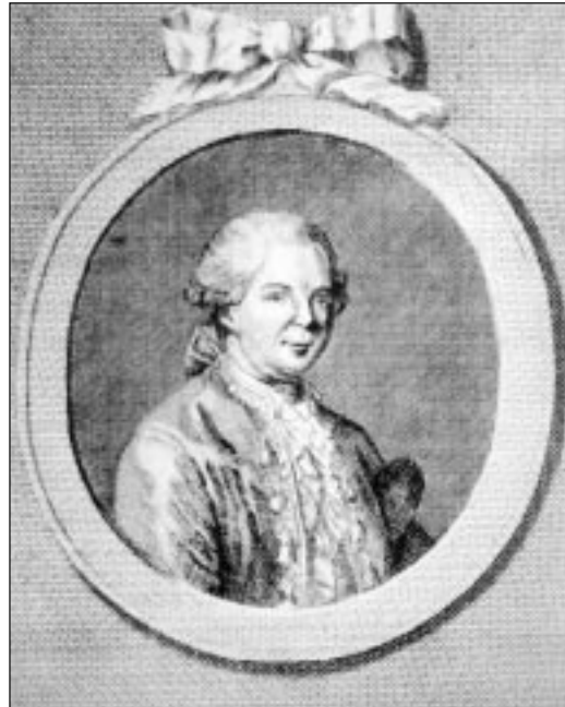
Fig. 8 Franz Anton Mesmer (1734-1815)