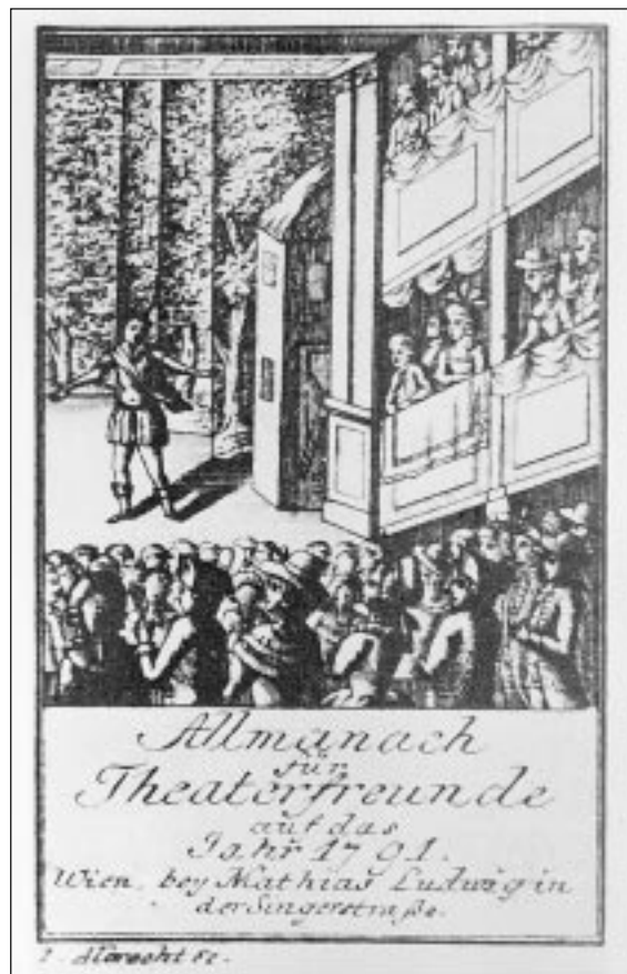
Fig. 1 The Freihaus Theater auf der Wieden in 1791. The performance illustrated is of the opera The Philosophers' Stone (Der Stein der Weisen)

The playbill (Fig. 2) for the first performance survives and on it are several ‘characters’ with whom we are mainly concerned, MOZART himself, Sarastro who heads the cast list, and the First Slave. The chain which links these three characters was forged by freemasonry, which in the Vienna of the 1780s was very active and popular amongst intellectuals. It is also worth noting at this stage that two other cast members, Franz Xavier GERL who played the original Sarastro, and Benedikt SCHACK who played Tamino, were both scientists by training, in the fields of physics and logic, and philosophy and medicine, respectively. Furthermore, both of the last mentioned individuals were also talented composers as well as singers who produced operatic works which both preceded and followed The Magic Flute .