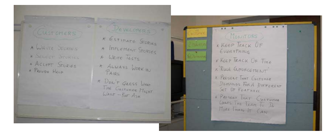
Figure 2: Customers, Developers and Monitors: List of Responsibilities

After being established, each team works in short cycles to create the artifacts to the specification of its customers on the teams. In each cycle the individual customers write many features of the desired object on 3 by 5 cards, one feature per card (e.g. a lion or a restaurant for a zoo) (cf. Fig. 3a).