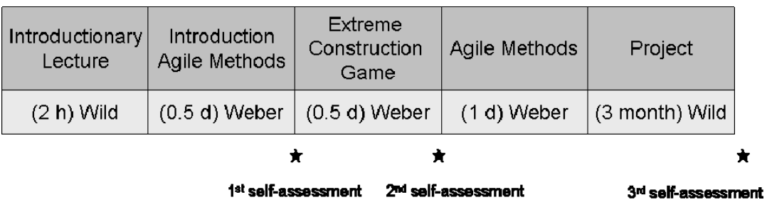
Figure 6: Course Structure

Before the experiment the students were given a short introductory lecture on XP by Werner Wild. In addition, project groups for the semester's project were built and the students have chosen their project topic and gathered some initial requirements.