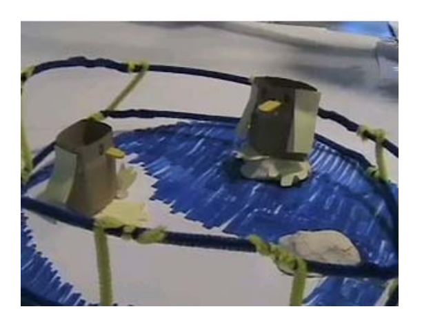
Figure 5: Product is Delivered to the Customer [Berg06]

The team then starts to build those features, but no others (cf. Fig. 4b). Developers always work in pairs when constructing. At the end of the 15 minutes iteration the constructed objects are delivered to the customer for acceptance or rejection. As soon as a feature (e.g., a penguin) is accepted by the customer it is integrated into the overall project (e.g., zoo) (cf. Fig. 5).