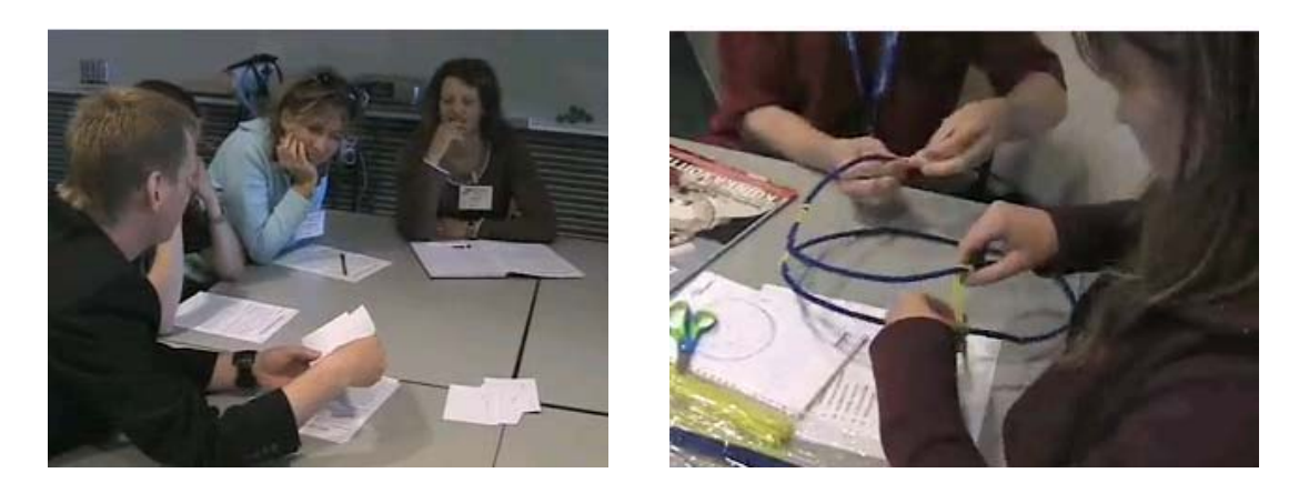
Figure 4: a) User Stories Are Selected by the Customers and b) Implemented by Developers [Berg06]

The team then starts to build those features, but no others (cf. Fig. 4b). Developers always work in pairs when constructing. At the end of the 15 minutes iteration the constructed objects are delivered to the customer for acceptance or rejection. As soon as a feature (e.g., a penguin) is accepted by the customer it is integrated into the overall project (e.g., zoo) (cf. Fig. 5).