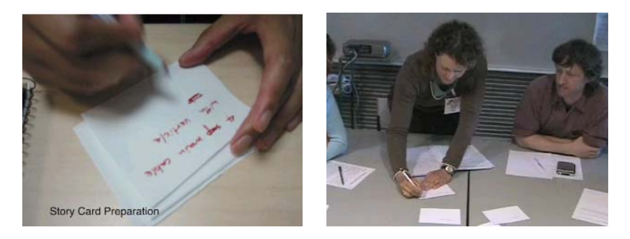
Figure 3: a) Writing Story Cards (Customer) and b) Estimating Stories (Developer) [Berg06]

After being established, each team works in short cycles to create the artifacts to the specification of its customers on the teams. In each cycle the individual customers write many features of the desired object on 3 by 5 cards, one feature per card (e.g. a lion or a restaurant for a zoo) (cf. Fig. 3a).