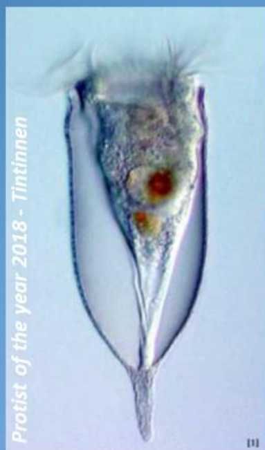
Protist of the year 2018 - Tintinnen