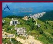
Fig. 2. The relicts of the talus breccia at Schachen are an example for an isolated geomorphic setting.

linked: A talus relict is „linked“ with its actual geomorphic setting if that deposit could still accumulate, in its whole extent, within that same setting, and at the same location and altitude (above sea-level) than the deposit is preserved. Example: A fossil talus slope that terminates at the same cliff toe-line and, downslope, pinches out at the same level than the actual talus slopes.