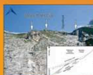
Fig. 4. The relicts of the Plattener talus breccia are offset from the area where the material is delivered.

Clear-cut distinction between the defined types of geomorphic linkage must be based on consideration of the entire depositional system (e. g. talus slope, alluvial fan) from which a fossil deposit accumulated. U-Th ages of cements of talus relicts, and consideration of additional undated talus relicts, together show that only a minority of the investigated talus relicts is preserved in geomorphic isolation. Most relicts are offset from or are still linked with their present-day geomorphic setting. Our age data do not imply a straightforward relation between the degree of geomorphic linkage of talus relicts and their age. The lack of a simple correlation between geomorphic linkage and age of talus relicts hints on more efficient action of linear-erosive processes relative to processes of denudation. Landscape dissection related mainly to ice streams, local (valley) glaciers and rock glaciers, and to linear incision by surface runoff in chutes, gorges and valleys, as well as to runoff-induced weathering gives rise to complicated relations between preservation of slope deposits, their age, and their geomorphic setting. The palaeogeomorphic significance of each talus relict must be assessed separately within its specific context.