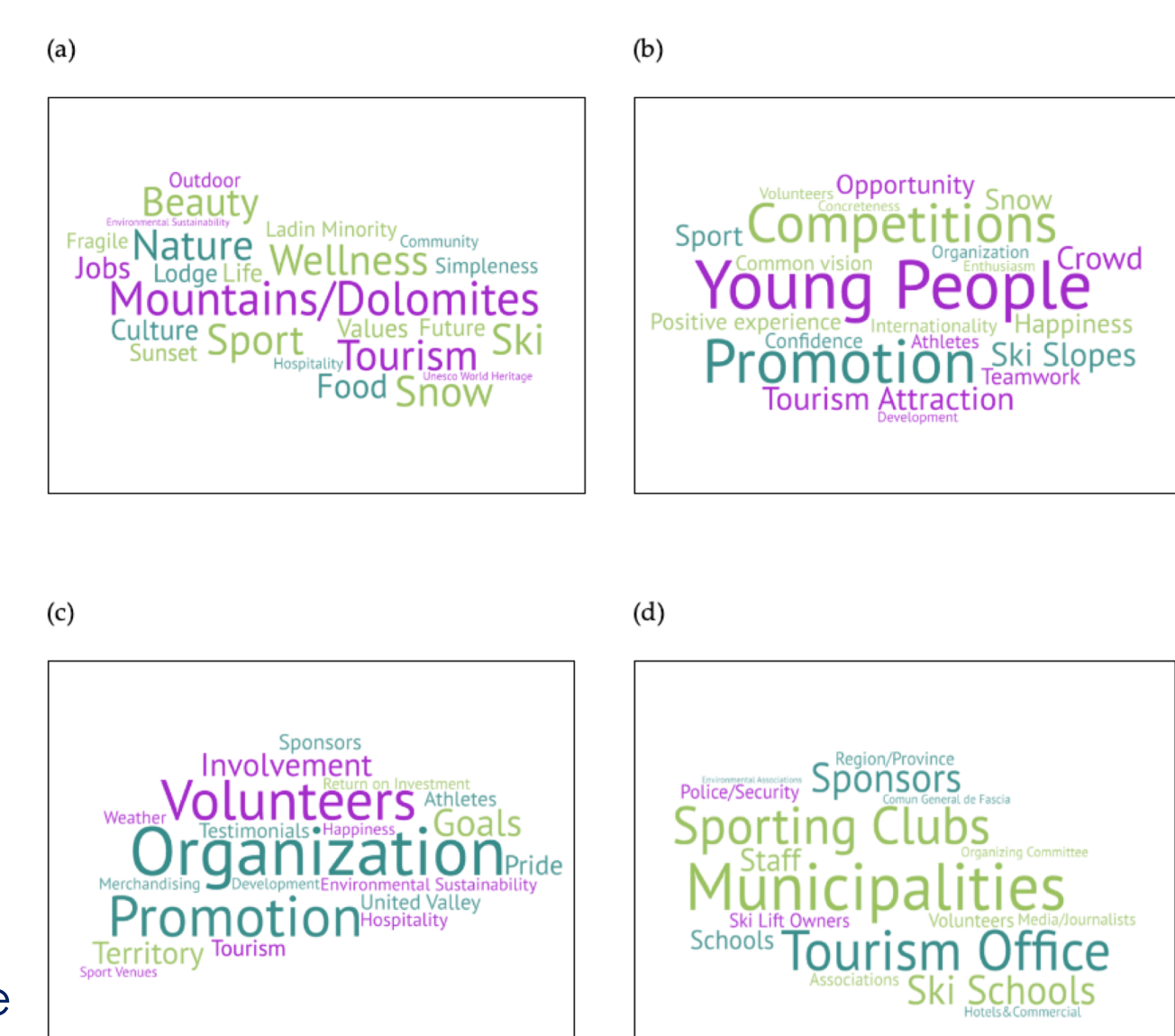
Fig. 3 Focus Groups Residents' Perceptions: (a) Val di Fassa in words; (b) JWC2019 in words; (c) The “Must have” for a sporting event; (d) Stakeholders of JWC2019.