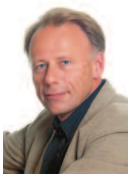
Federal Environment Minister Jürgen Trittin

The Alpine Convention and its origination process demonstrate an approach to the organisation of sustainable development in transboundary mountain regions. The integrative approach of Alpine cooperation, from environmental and nature conservation, to regional, economic and social development, through to joint cultural activities, may serve as an example for strengthening public participation and democracy, for environmentally, economically and socially compatible progress, and for international cooperation in mountain regions that is based on solidarity and responsibility. For the Alpine region, however, it will be vital for all protocols, particularly the transport protocol, to enter into force in all Alpine states as quickly as possible.