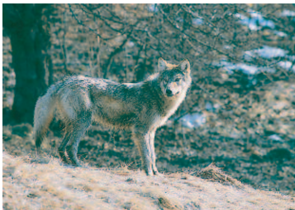
Carpathian wolf

The highest elevation is the Gerlach Peak (2,655 m) in the High Tatras (Slovakia). Around half of the Carpathians are covered in forest, which are home to some of the last remaining primeval forest in Europe. The Carpathian forests are a vital link between the Nordic forests and the forest regions of Western and South-Western Europe. One-third of all European vascular plants (with over 4,000 species, including 481 endemic species) are found in the Carpathians. The Carpathians are still home to a number of large predators (8,000 bears, 3,000 lynxes, 4,000 wolves) and the imperial eagle, threatened with worldwide extinction. Around 16 % of the Carpathians are under some form of protection.