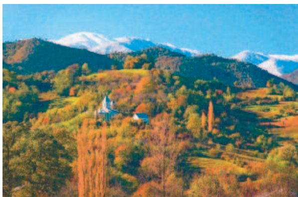
Borjomi-Kharagauli National Park / Georgia National park administration, WWF and German development cooperation together for man and nature in Georgia

Firstly, the national coordinators are ensuring an exchange between all parties involved, above and beyond national borders. This will help to resolve conflict through practical cooperation. Secondly, decisions are also taken in close collaboration with the local population, whose needs and own suggestions should provide guidelines for the project.