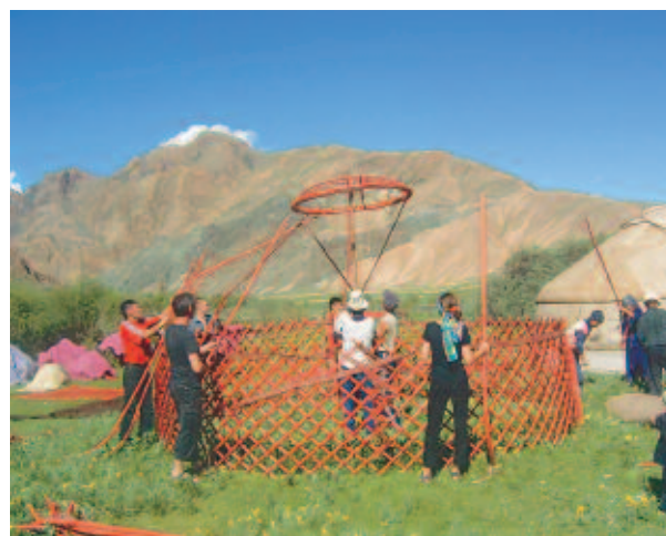
Yurt construction on the summer pasture of an AGOZA village in a valley of the Narynskaya Oblast (2,800 m) / Kyrgyzstan.

The experiences from the network of communities “Alliance in the Alps”, which was initiated by