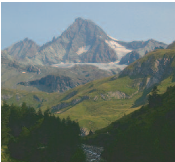
The experience gained in the Alpine region can also be useful for other mountain regions

The formulation of international agreements aimed at promoting and regulating sustainable development in a mountain region is a protracted process. Work to create the legal framework – the Convention and its nine Protocols to date – has been underway since 1989. The Alpine Convention entered into force in the eight contracting states in 1995, followed by its nine protocols in Austria, Liechtenstein and Germany in 2002. In 2003, Slovenia ratified all protocols, whilst Monaco and France ratified some of them.