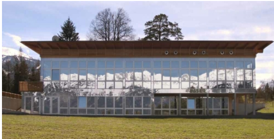
Meeting Center Grillhof Grillhofweg 100 6080 Vill