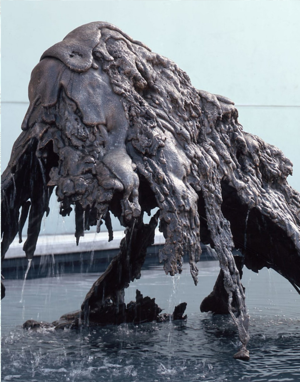
CHIMERA 1988 Lynda Benglis

Meetings: Wednesdays & some Thursdays @ 9:00-17:00 (detailed schedule will be handed out first day)